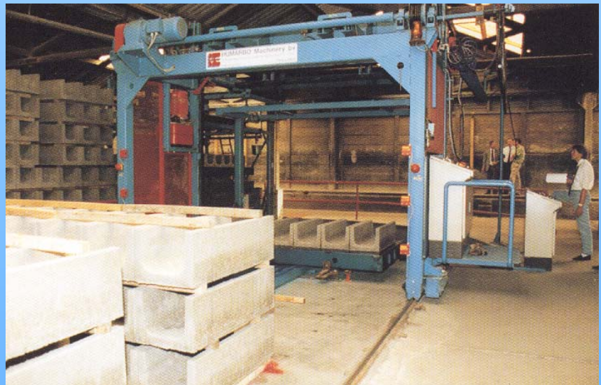
Installation with take-off machine for the manufacture of Cable Troughs

high productivity – low labour costs – high frequency vibration