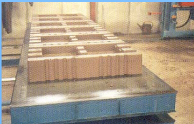
Crib wall elements